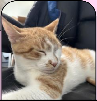
Socks & Shoes

A young woman got Socks and Shoes when they were little kittens from a friend. They were full of energy and sweetness. But now that they have grown and are 7 months, she decided she no longer wanted them because they are getting to be adults. She only likes "babies." Socks and Shoes are very confused as to why they were abandoned and wondering what they did wrong. They are two of the most loving kittens and we are trying to reassure them that they will get a loving home soon!