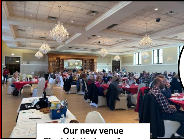
Our new venue The Irish Heritage Center

The Ruby gemstone symbolizes LOVE, PASSION, SUCCESS – HALLMARKS of OUR Mission through the years!