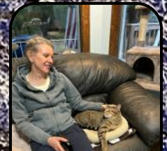
Bobbie & Shamrock

In Winter '24 we had our electrical and plumbing checked and upgraded. Our Winter and Spring '24 operational needs/plans/hopes are: