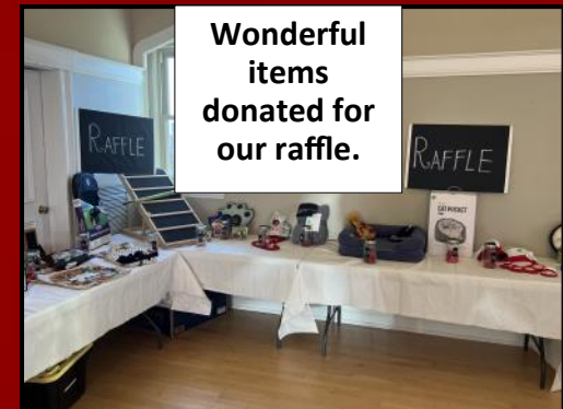
Wonderful items donated for our raffle.

Delicious vegetarian brunch Benefit, with vegan options, Gifts—Raffles— Silent Auction—Prizes Advanced tickets required. See TBA website or call 773-728-6336.