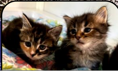
Sapphire & Gem