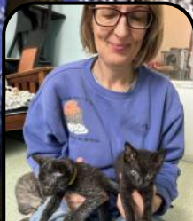
Vanda, Blue & Green