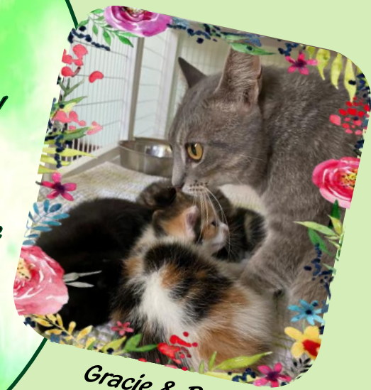
Gracie & Babies