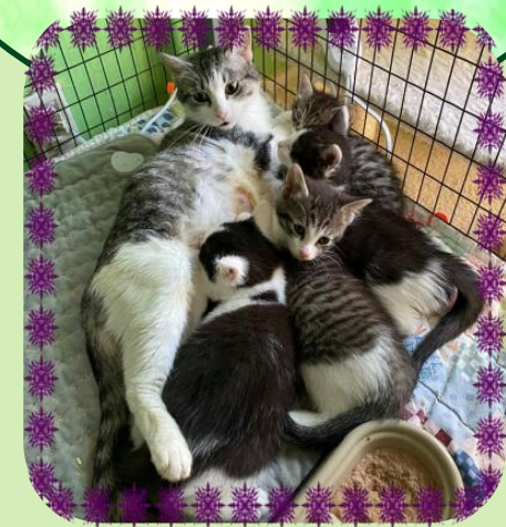
Violet & Babies