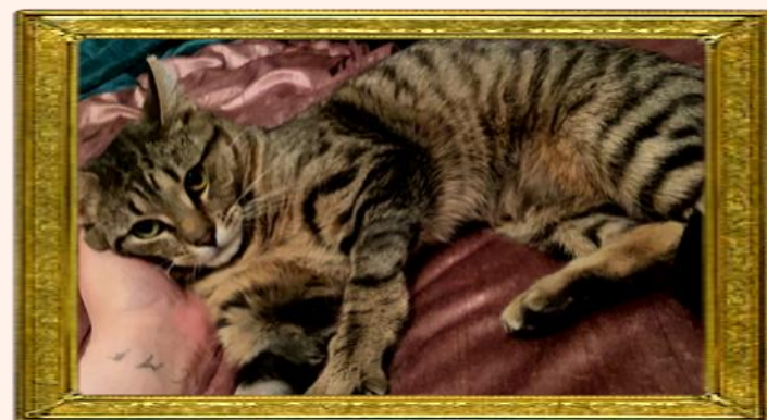
Jackie Chan today in his new home.

Waiting for the phone call the next morning, I offered a special prayer to our Creator of Life to inspire some of our caring friends who have the means, to donate generously in the near future. Or for one of the charitable foundation grants we continuously apply for to arrive.