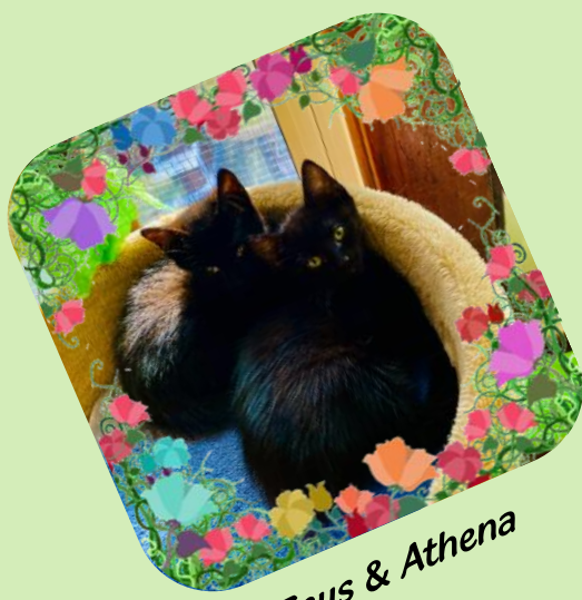
Zeus & Athena