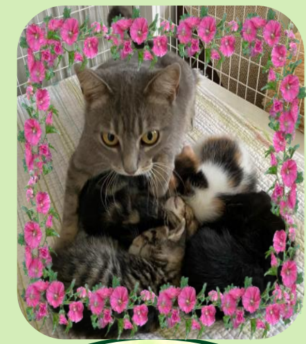
Mama & Babies