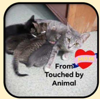
Mouse & Babies

When this little cat was rescued, she was so small and thin, the children who found her named her Mouse , and we thought she was a neutered male. As her lean body began to fill out, we congratulated ourselves on feeding her with high-nutrient prescription food. An ultrasound confirmed our suspicion, however: Mouse was pregnant, with excess amniotic fluid causing her soft bulging. Sweet little Mouse gave us an overnight purrfect surprise of three healthy kittens. We are so very glad we could give her a safe home, nutritious food, and vet care just in time!