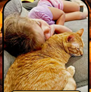
Forever Home Forever Love