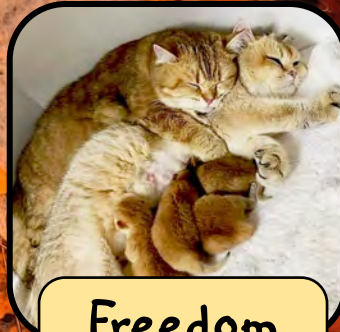
Freedom from Fear