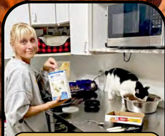
Nourishment with Love