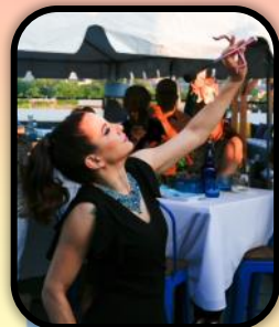
Fire Eater Entertainment