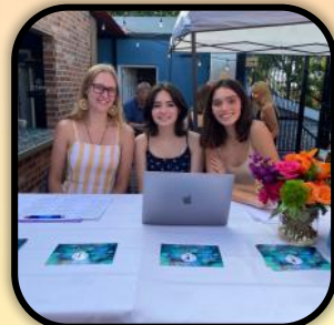
Golden Family Volunteers