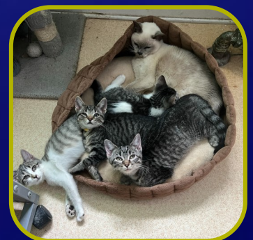
Will You Adopt Us?