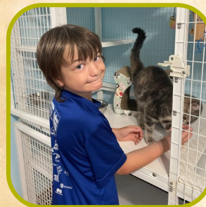
Kendall & Carrot