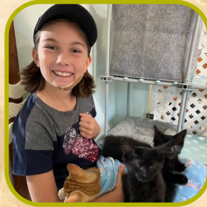
Cora with Kittens