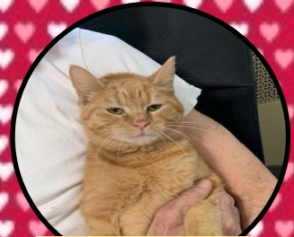
Ophelia, 8 months