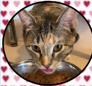
Pepper, 1 year 3 months