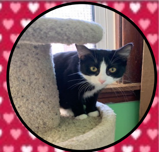
Bellatrix, 8 months