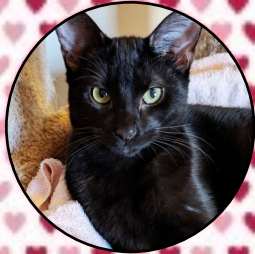
Feisty, 2 years