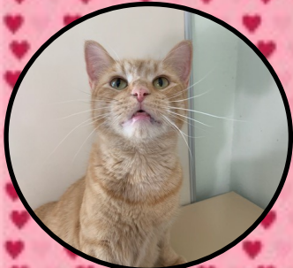
Opal, 2 years