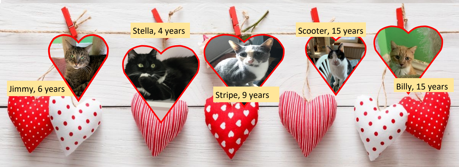
Jimmy, 6 years