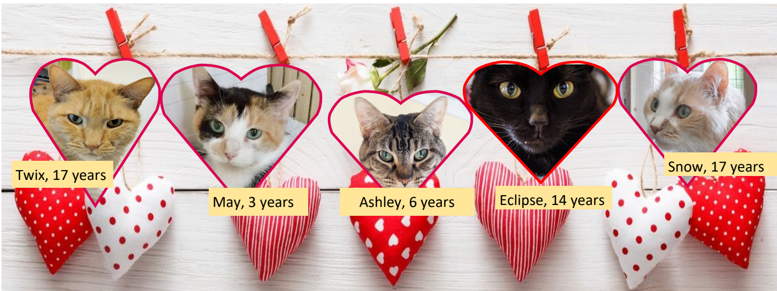
Twix, 17 years