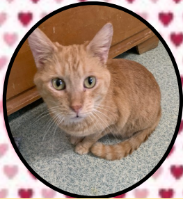
Simba, 4 years