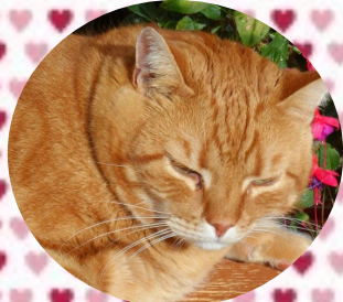
Cisco, 12 years