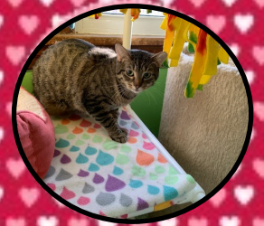
Sophie, 2 years 6 months