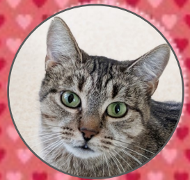
Mama Pasta, 3 years