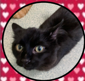
Gregory Peck, 6 months