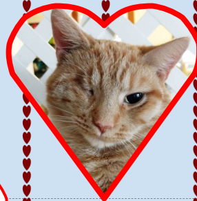
Crackle 4 years