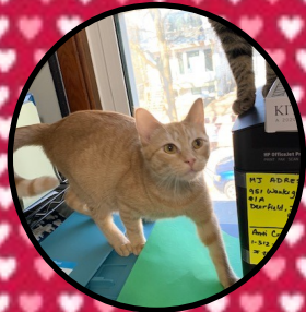
Olive, 8 months