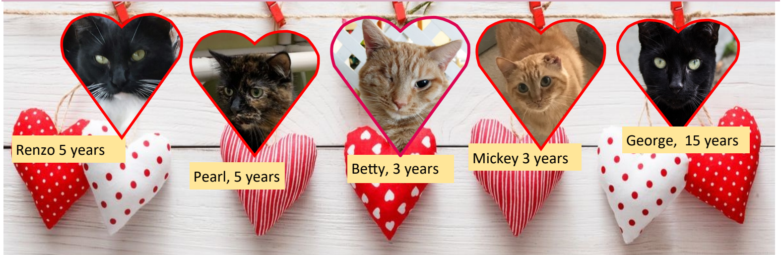
Renzo 5 years

Help us by sponsoring one of our older or special needs cats. Some are just super shy but some have issues that make it hard to get them adopted.