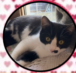
Tuxy, 1 year 6 months