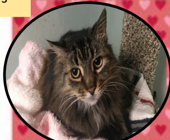
Smoke, 12 years