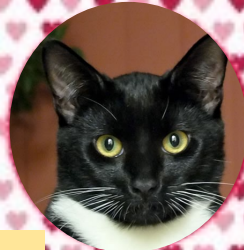
Angelo, 5 years