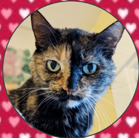
Gizmo, 8 months