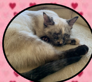
Grace Kelly, 6 months