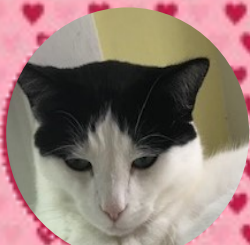
Peanut, 5 years