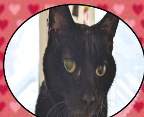
Lottie, 13 years